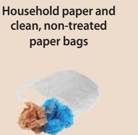
Plastic bags (stretchy) (remove paper receipts)