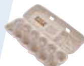
Egg Cartons (Paper & Foam)