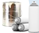
Empty Paint Cans & Aerosol Cans (empty & dry, lids removed)