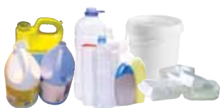
Plastic Bottles, Jugs, Tubs, Pails, Trays & Foam Packaging