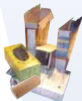
Cereal/Tissue Box, Cardboard Tubes