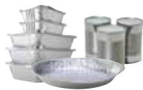
Aluminum & Steel Cans, Aluminum Foil, Pie Plates & Trays