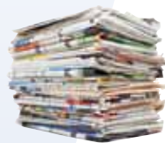
Newspapers, Magazines, Catalogues, Inserts, Telephone Books and Books